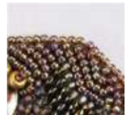
Clean Edge DBE pg 63