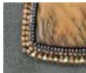
Two Bead Edge BWC pg 21