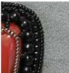
Turn Bead Edge BWC pg 25