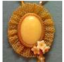
Ruffled Edge BWC pg 38