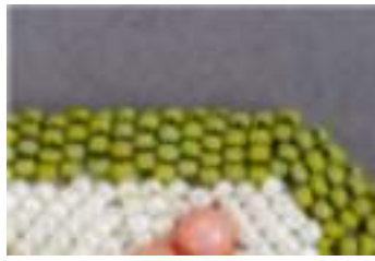
Lazy Edge DBE pg 78