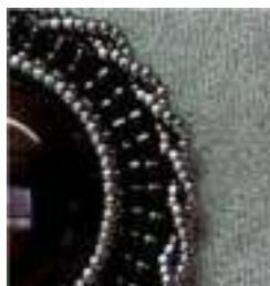
Twisted Edge BWC pg 32